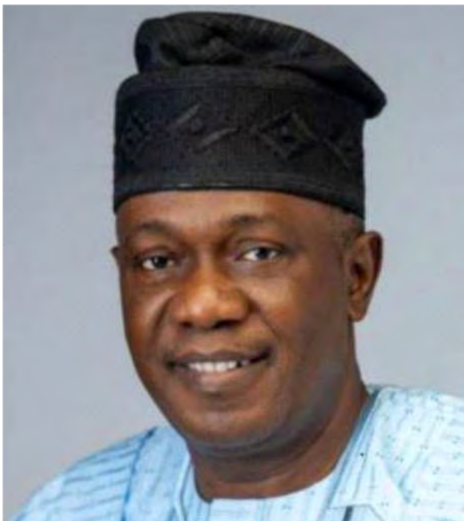
Hon Moruf Akinderu-Fatai

purported availability for sale or rent as stated in the online video is therefore a fraudulent act by the agent," he said. The Commissioner also reminded members of the public that "Lagos State Government does not engage agents to sell, lease or rent housing units in government-owned housing estates, adding that estate department of the Lagos State Ministry of Housing is solely responsible for the outright sale of housing units in Lagos State Housing Estates, while allocation for the Mortgage or Rent-To-Own scheme is a responsibility of the Lagos State Mortgage Board. Hon. Akinderu-Fatai also advised prospective home