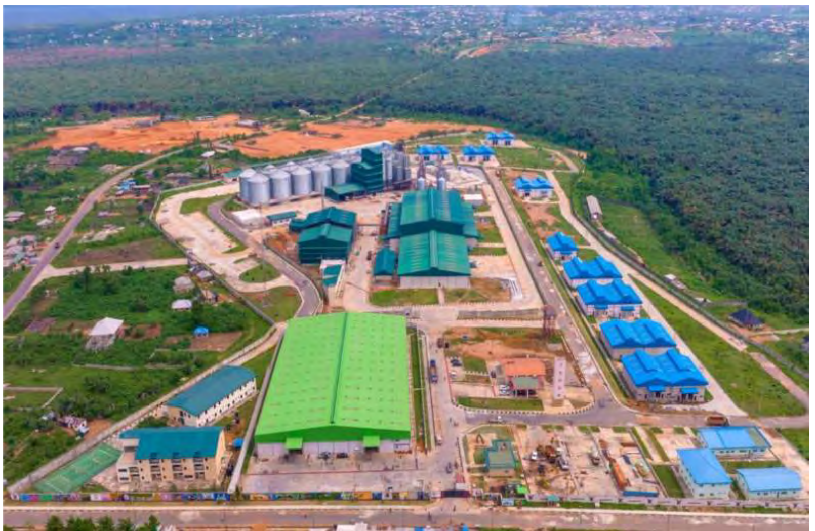
Imota Rice Factory

In the 2025 budget, the Lagos State Government allocated approximately N25.5 billion to the agricultural sector. This represents a significant commitment to strengthening food production, improving value chains, and